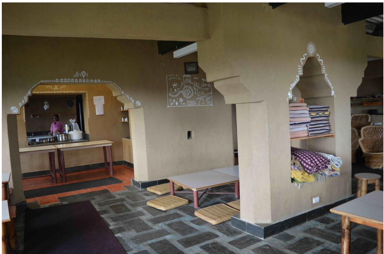
Kitchen and dining hall at Sambhaavnaa