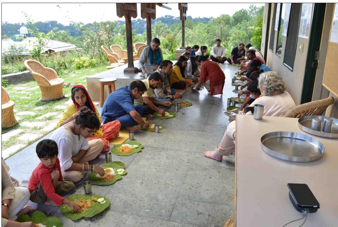
Lunch on Day 3. Traditional Himachali reception known as Dhaam, rice served with delicious traditional curry recipes prepared using local millets and grains from Himachal Pradesh. Samabhaavnaa kitchen team prepared Rajma ka Madra, Khatta; made from chana and aamchuur, delicious sour and spicy and Sepu vadi; gravy of white lentil dumplings.