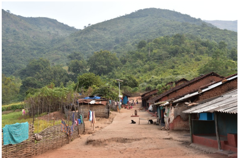
The Domb settlement of Sanodenguni village

These articulations need to be considered by both the communities for a sustainable future in the hills.