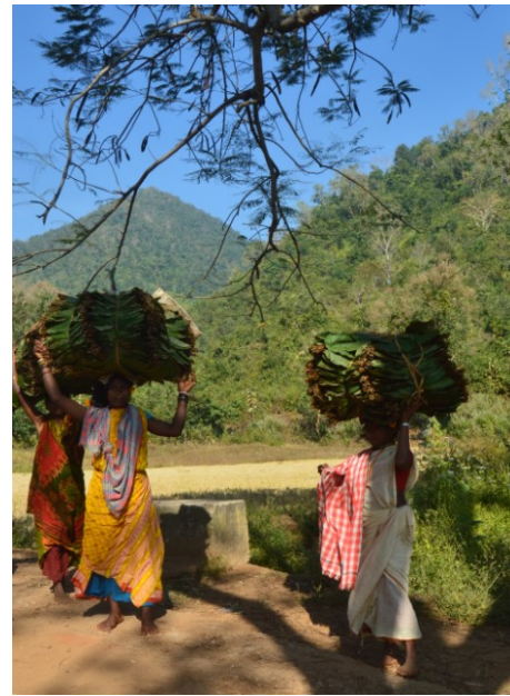
Women carrying budles of Siali (Bauhinia vahlii) leaves to sell in the market

While we were at Niyamgiri, we were told that they cultivate over 20 varieties of millets on their podu fields, apart from lentils and oilseeds. In the 1970s, they were introduced to horticulture and have started growing pineapple, oranges, lemons, and bananas on a large scale, which they sell in the markets 41 .