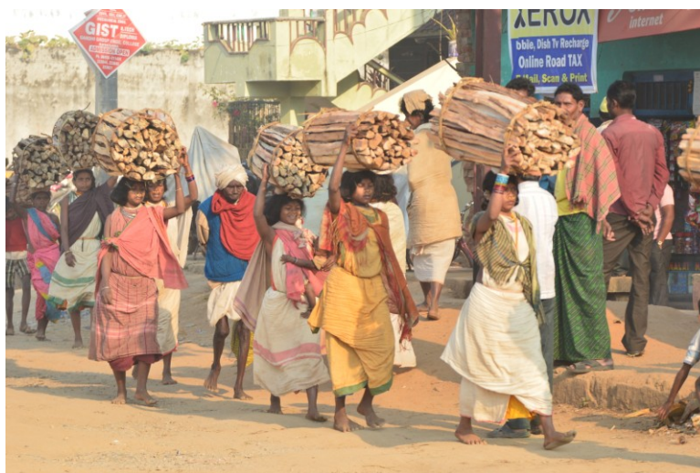
Dongria Kondh women carrying wood to sell in Muniguda

Easy access to certain 'goods' and 'services' through government schemes has begun to change their way of life. Rationed goods, especially rice through the Public Distribution System has changed their food consumption pattern, away from millet production and consumption, which they have been self-sufficient in.