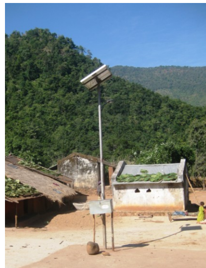
Solar lamp at Serkapadi village

Most Dongria Kondh the team met were critical of the role of the DKDA. In most of the villages, the schemes carried out by the DKDA are not done in consultation with the village. The DKDA distributes solar lamps, builds concrete roads in some villages,