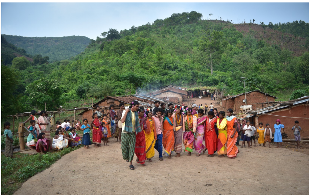
Young boys and girls dancing at a wedding feast

The Dongria Kondh are aware that to a large extent, money has become a necessary factor to live in the Niyamgiri hills and interact with the outside world. The Dongria Kondh explained that their need for money some