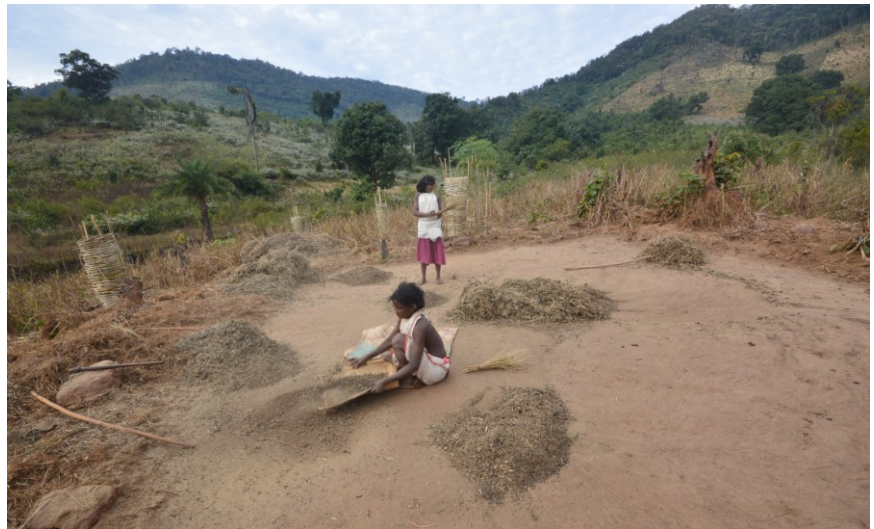
Harvest time in fields

have a soul, which is to be revered. Thus, the polytheist, animist belief is guided by the proximity to the moods and rhythms of nature, commanding respect for and co-operation with natural forces. This is reflected in the way of life practiced by the community and in their socio-cultural relationships. The Niyamgiri hills, abode of Niyamraja are thus entirely sacred, and the daily practices of life, habitation and subsistence are thus deeply integral to the sacred life-giving capacity of Niyamgiri.