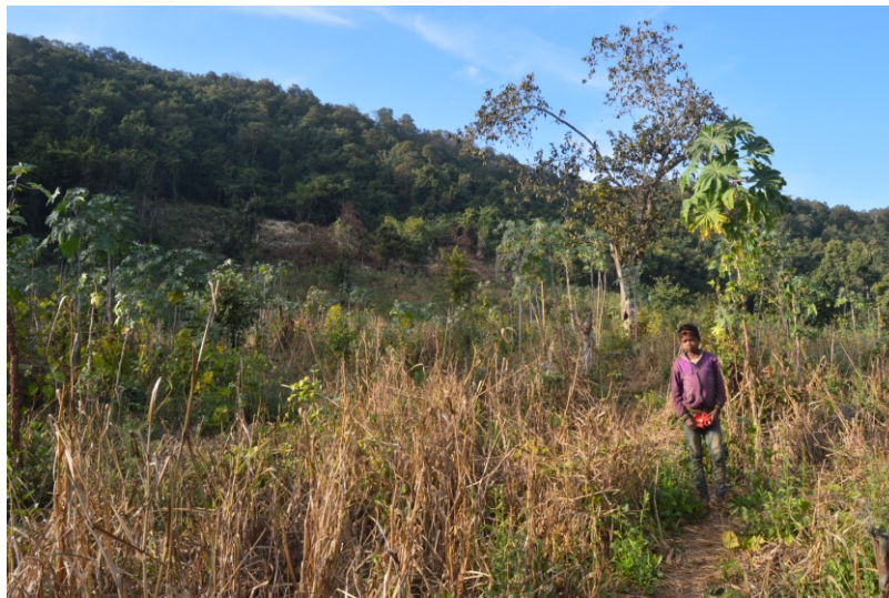
Boy guarding the podu field

pointed out that the religious and cultural rights of the Dongria Kondh as recognized under the FRA, were not put before the community over the land to be mined for bauxite, for their 'active consideration'. Thus, it ordered the state of Odisha to place these issues before the Dongria Kondh 43 . In July and August 2013, gram sabhas were organized in 12 villages of Rayagada and Kalahandi districts by the state, and all the 12 villages rejected the mining proposal. Prior to the palli sabhas , in 2013, the Odisha state government illegally 44 prepared a report of the community claims over minor forest produce, grazing land, podu fields etc. The reports were placed before the villagers during the palli sabhas ordered by the SC. The villages however, rejected the community claims and individual claims over minor forest produce, grazing land and podu fields that were placed before them. This was because the claims over land and resources put forward by the officials were divided, classified and measured into measured categories like grazing land, sacred spots, streams. 45