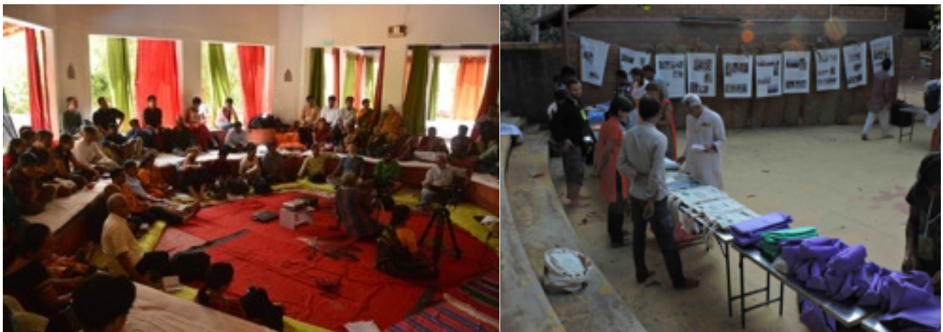
Photographs from the first two Sangams at Timbaktu (left) and in Madurai (right)

The process was initiated in 2014 with the first Sangam at Timbaktu. Since then, there has been a series of regional Sangams and one thematic Sangam (on Energy).