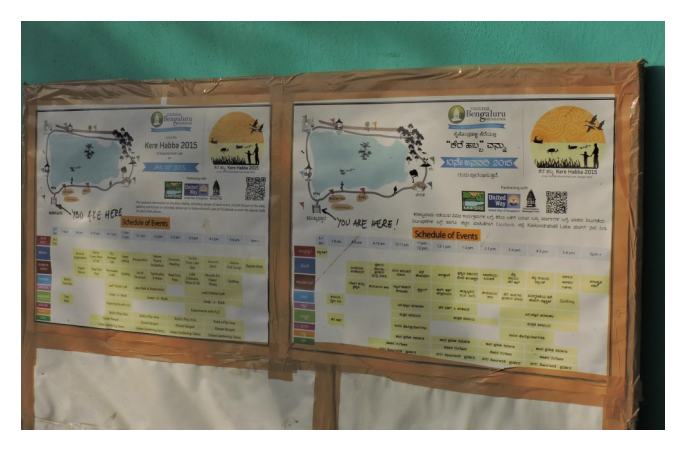
Public events frequently held at Kaikondrahalli

ecological recovery of the lake. A year after restoration, the lake was found to attract over 50 species of birds, and a rich variety of butterflies, frogs, toads, and snakes: the variety of animal and insect biodiversity around the lake has grown substantially since then, with many more bird species added to this list. A large and growing number of people living around the lake visit the lake frequently, and have participated in a number of activities associated with lake restoration, maintenance and fund raising over the years. No ticket fees are charged for entry, and the lake is maintained using donations and funds from local individuals and organizations.