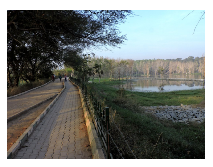
Kaikondrahalli walkway and cycle track

Over the years, local residents have seen the