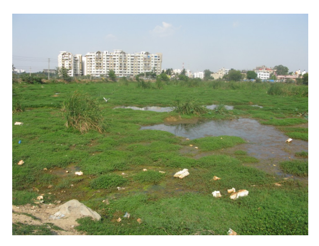
Kaikondrahalli lake in polluted condition in 2009, prior to restoration