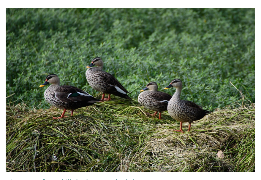
A group of spotbill ducks near the lake

Kaikondrahalli lake is located in the south east of Bangalore, on Sarjapur road. The area surrounding the lake has experienced a multifold increase in real estate value in the past decade. Sarjapur road, which runs past one edge of the lake, is congested with traffic, while the lake itself is surrounded by all the dystopic elements of modern Indian cities - malls, apartments, and IT companies along with shanties and tented slums. Older residents around the lake describe a much different landscape. As recently as 2000, the lake was filled with fresh water, surrounded by groves of fruiting trees, and frequented by birds, foxes, and snakes. By 2003 the lake had begun to dry up, with the incoming channels to the lake blocked by construction and the dumping of debris and garbage. By 2007, the lake bed was a slushy malarial bed of sewage and waste. On one memorable walk around the lake in early 2008 in which I participated, we came across an illegal and disused borewell, a recently dug grave, a number of broken alcohol bottles, a discarded pack of playing cards and a tarpaulin sheet, the carcass of a dead pig, and a breathtaking swarm of iridescent dragonflies: an indicator of the eclectic mix of undesirable activities and ecological and environmental uses of the lake.