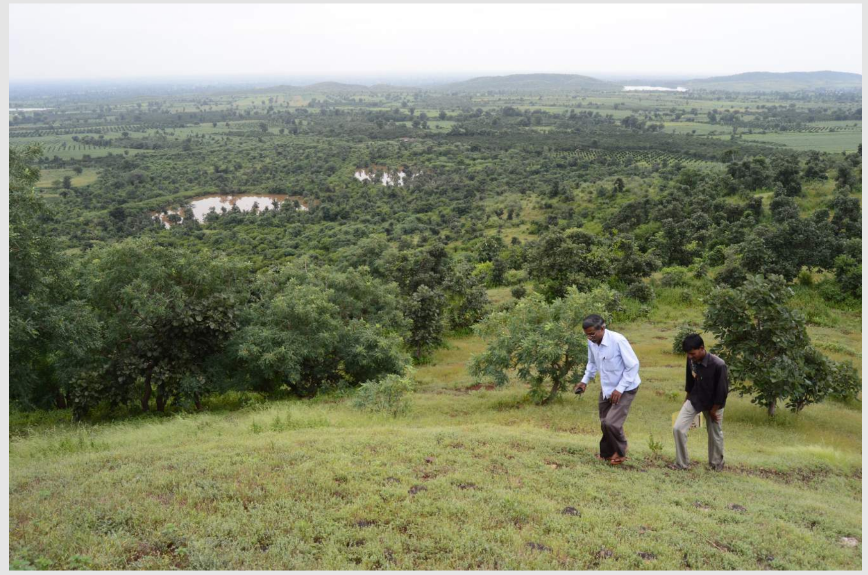
Above: The pasture-forest matrix of Nayakheda village in Maharashtra, protected legally through the Forest Rights Act, by the local community.

In the village of Nayakheda in Maharashtra, Khoj facilitated the filing of Community Forest Rights (CFRs) under FRA and the title was granted to the village in 2012. Since then the community has taken various measures to protect forests over 600 hectares, including a ban on hunting and cutting whole trees for firewood. In addition, fines are levied for grazing in non-designated areas and steps taken to mitigate fires.