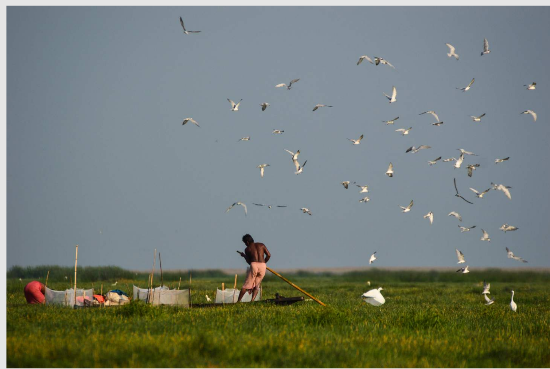
Above: Human and avian co-existence in Mangalajodi, Odisha.

The idea of protecting forests is not limited to their role in providing resources for human use, but also for their own sake.