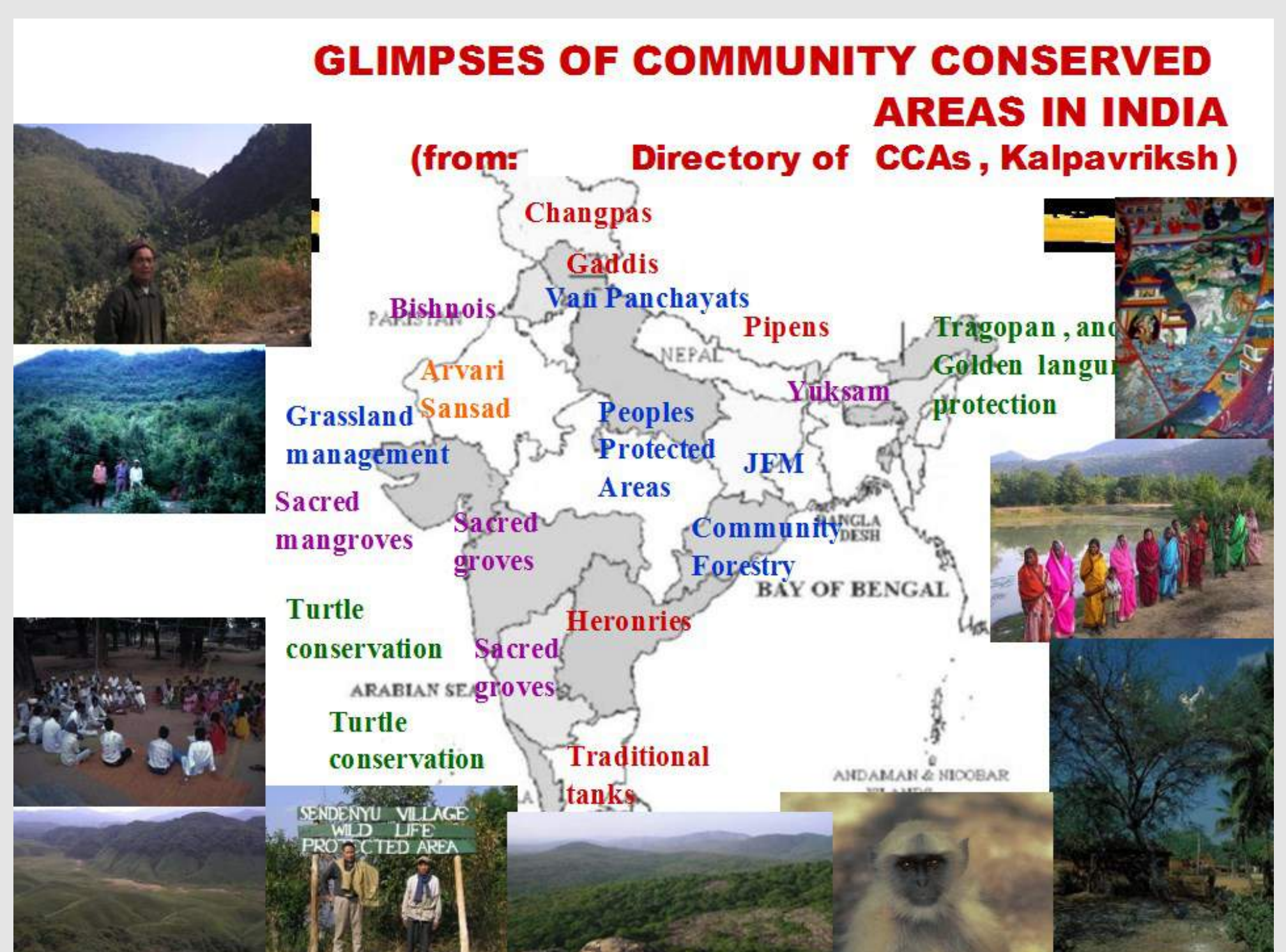
Above: A Kalpavriksh poster that gives a glimpse of the diversity of landscapes and initiatives under CCAs in the country.

A directory published by pune-based Kalpavriksh is the world's first country-wide compilation and analysis of CCAs (community conserved areas). It describes a diversity of initiatives, attempting to gain a deeper understanding of conservation of biological diversity, local livelihoods, peoples' rights and development, through around 140 case studies across 23 Indian states.